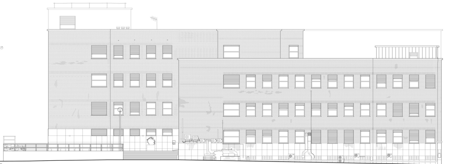
Prospetto C C'